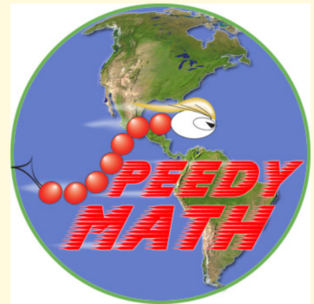
US Mental Math - Speedy Math Competition