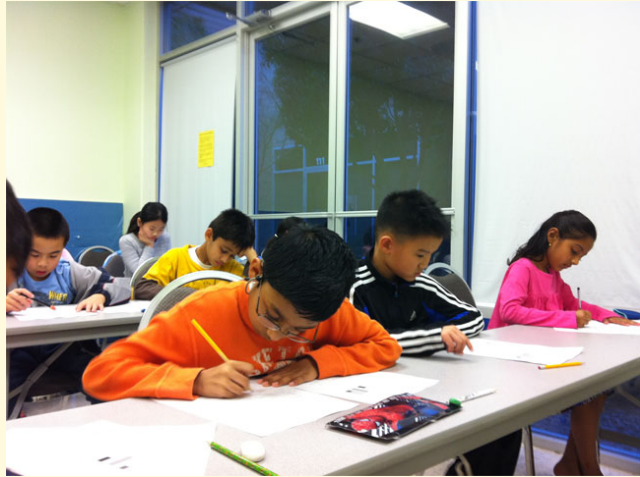
2nd and 3rd grader Online Math League Tests

The honorable students included in our "Hall of Fame" are also posted in the IQ Abacus facebook which can be easily located at http://www.facebook.com/iqabacusmath .