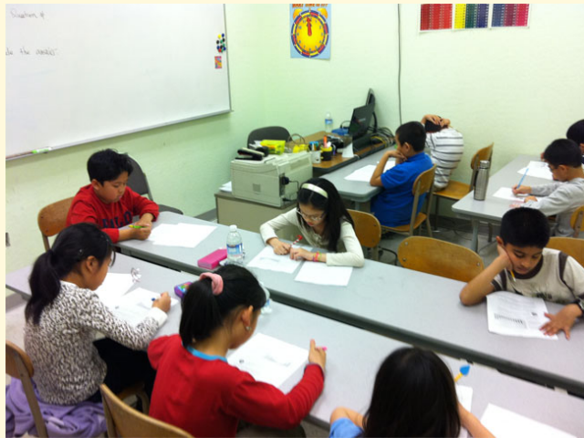
4th grader Online Math League Tests

Congratulations to all the students who managed to include your names in the "Hall of Fame"!